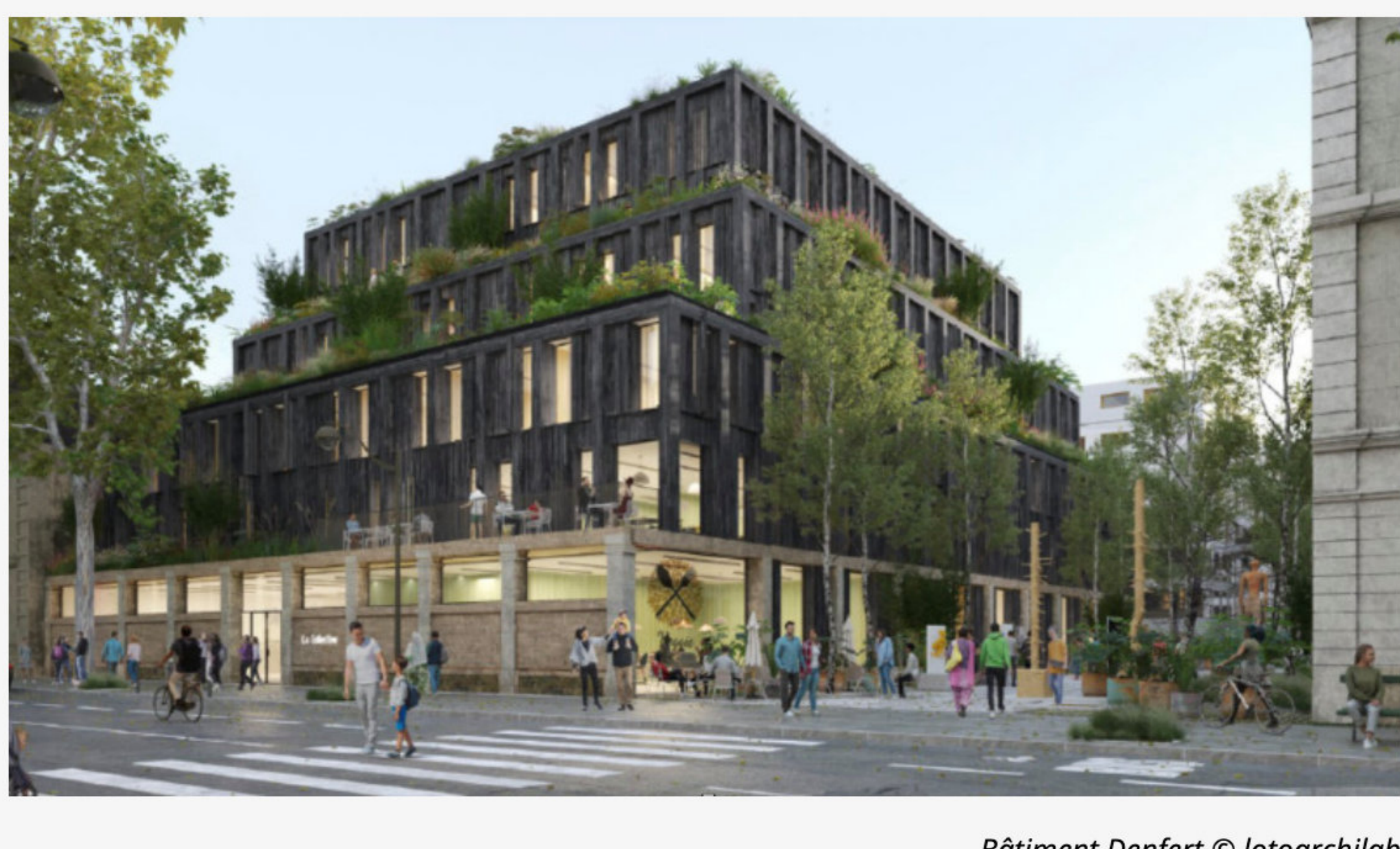
Bâtiment Denfert © Iotoarchilab

More information on: thanksfornothing.fr