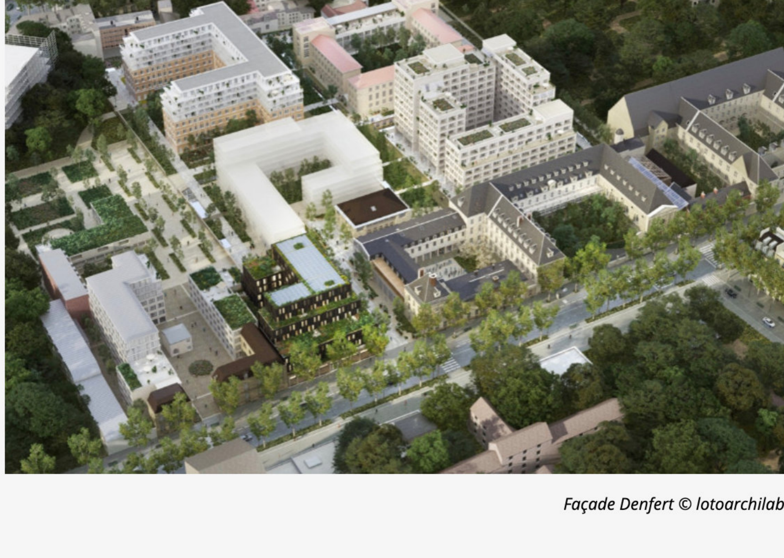
Façade Denfert

We are pleased to announce that Thanks for Nothing has been designated winner of the City of Paris competition for the Denfert Facade of the former Saint-Vincent-de-Paul hospital in the 14th arrondissement.